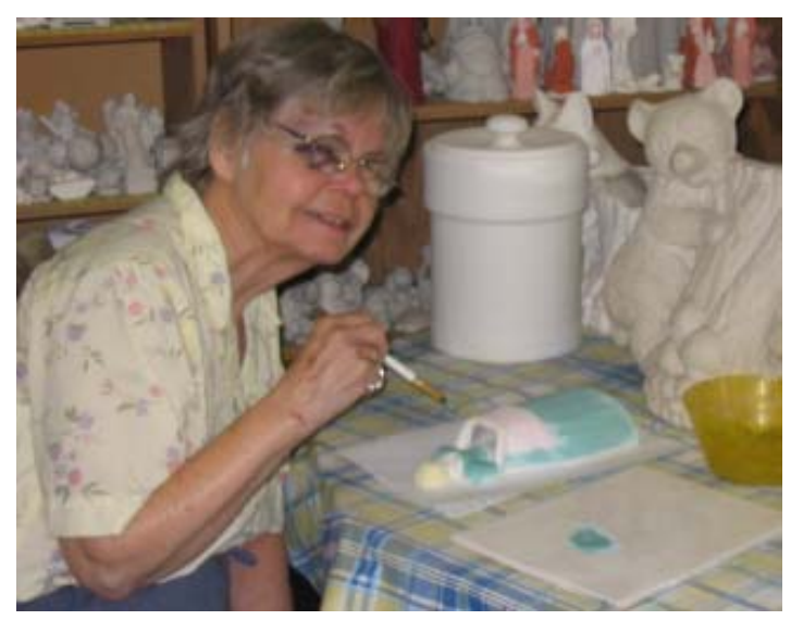
Dawn participates in the ceramics workshop in North Vancouver.