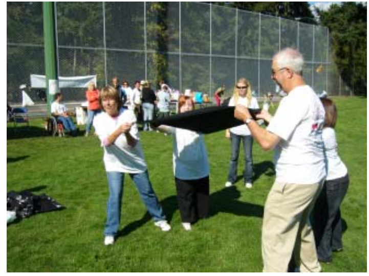
One of the events involved the teams tossing water balloons at each other... using a plastic garbage bag.