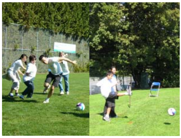
Three-armed soccer, with three legged goalies. What better scenario for some light hilarity?