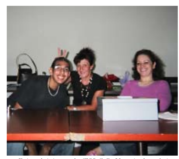
Doing admissions at the CISS Coffee House is always fun!