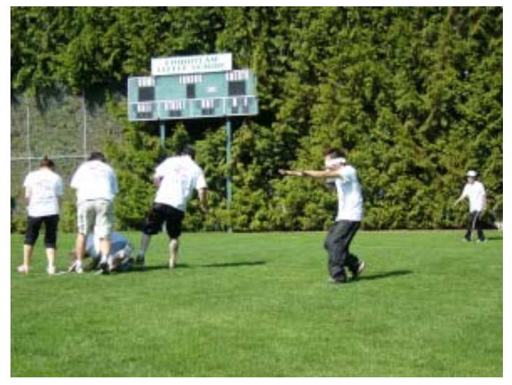
Blindfolded, one member of each team tried to find the other team, who were all tied together at the ankle, while his or her teammates called out the general direction to go.