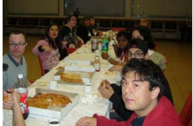
Christmas pizza party.