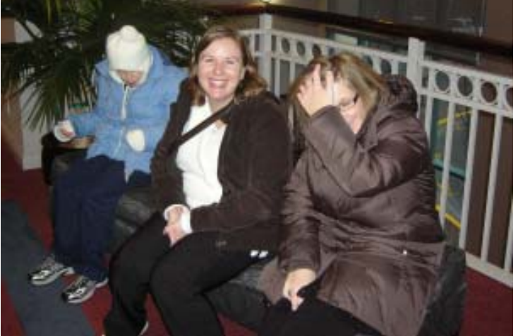
Waiting for Christmas lunch.