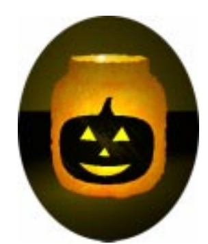
When the candle is lit, it will shine very prettily through the tissue paper.