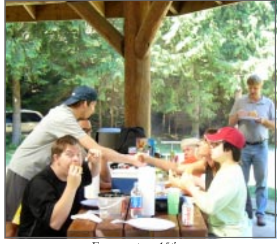
Everyone at our 15th anniversary BBQ indulged in the food and fun.

In the afternoon, after everyone had eaten, certificates were given to those who have been with CISS since the beginning, 15 years ago. Eight participants from Inlet Enterprises and one staff member were each presented with a certificate. Congratulations to you all!