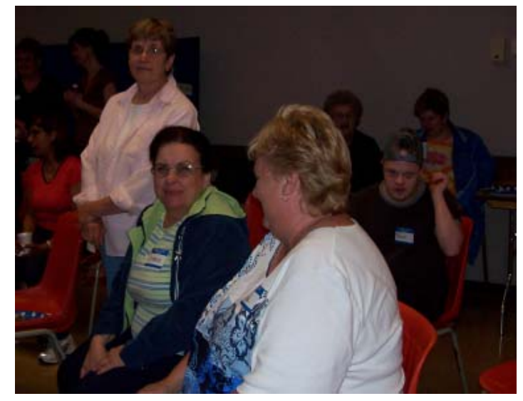
Chatting before we start!