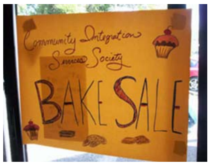
CISS's bake sale sign at coffeehouse.