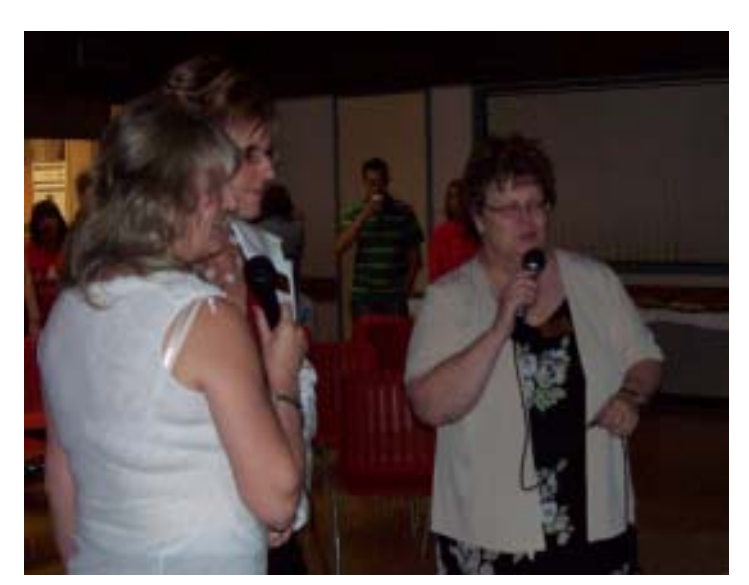
Time out for karaoke fun.